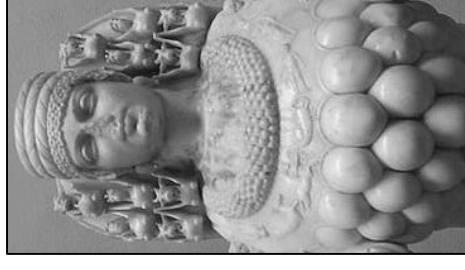
Artemis of Ephesus

Ephesus was a stronghold of the occult. The phrase "Ephesian writings" was common in ancient times for documents containing spells and magical formulae. The use of magical names in spells to drive out evil spirits was common. Jewish practitioners of magic were highly regarded, because people believed they had command of extremely effective spells. Their reluctance to speak the divine name was often misinterpreted as reluctance to say their most powerful magical name. They often called themselves 'priests'.